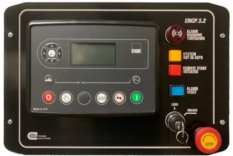
Image for Illustrations Purposes Only, Your Actual Product May Vary

Discover more at electronil.com/encp_3.2